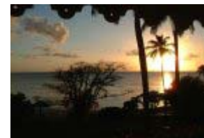
Sunset over the Hawks Bill

The island reputedly has 365 beaches, one for every day of the year! Enjoy the fantastic hospitality provided by the islanders during this superb regatta. In between the racing, there are plenty of opportunities to swim, sunbathe and relax before starting the evening with the obligatory sundowners! Use Lay Day to explore the island by car, play a round of golf or simply sunbathe and enjoy a cruise to beautiful Green Island where only a reef separates the tranquil lagoon from the rollers of the Atlantic. Only Antigua could provide the diversity of relaxation, excitement and partying in such a beautiful location.