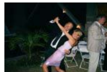
The Lord Nelsons Ball!

The world famous regatta is based in English Harbour that also provides a fantastic historical setting and a great party atmosphere – don't miss the Mount Gay beach party! Each race lasts 3 to 4 hours using the waters on the west side of the island. Evening stopovers at Dickenson Bay and Jolly Harbour enable crews to experience fantastic partying Antiguan style - you cant miss the Great Dickenson Bay Beach Bash!