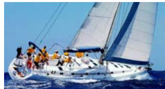
It could be you! - The Ocean Race

The world famous regatta is based in English Harbour that also provides a fantastic historical setting and a great party atmosphere – don't miss the Mount Gay beach party! Each race lasts 3 to 4 hours using the waters on the west side of the island. Evening stopovers at Dickenson Bay and Jolly Harbour enable crews to experience fantastic partying Antiguan style - you cant miss the Great Dickenson Bay Beach Bash!