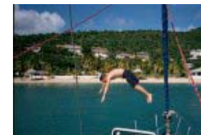
Cooling Off at Galleon Beach!