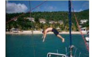
Cooling Off at Galleon Beach!