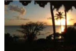
Sunset over the Hawks Bill

Only Antigua could provide the diversity of relaxation, excitement and partying in such a beautiful location.