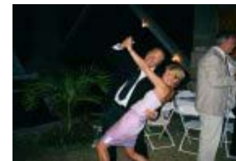
The Lord Nelsons Ball!

Evening stopovers at Dickenson Bay and Jolly Harbour enable crews to experience fantastic partying Antiguan style - you cant miss the Great Dickenson Bay Beach Bash!