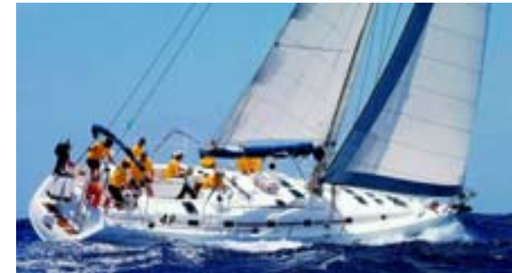
Southern Accent during Day 5 - The Ocean Race

The world famous regatta is based in English Harbour that also provides a fantastic historical setting and a great party atmosphere – don't miss the Mount Gay beach party! Each race lasts 3 to 4 hours using the waters on the west side of the island.